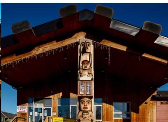
Kermode Friendship Centre, Terrace

Construction of a 44-acre rail trans-load facility including civil, rail, water, storm, and utility infrastructure. Over 100,000m 3 of material moved, with complex coordination and successful completion.