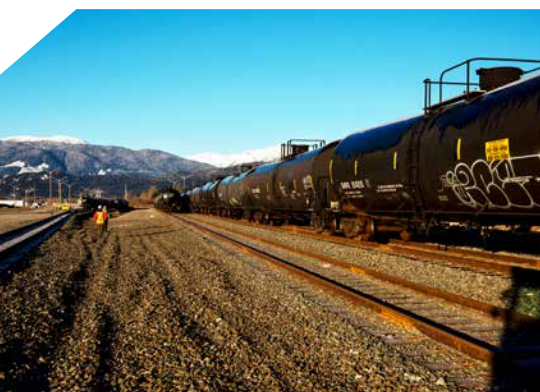
NSD Inland Port Site, Terrace

Progressive Ventures Real Estate Commercial & industrial property management