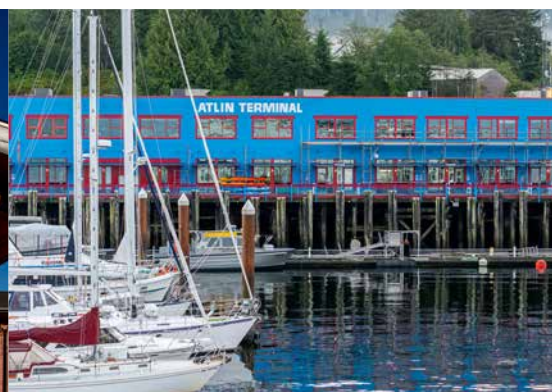
Atlin Terminal, Prince Rupert

A design-build project which entailed overseeing re-zoning and development permits, facilitation of design workshops with the owner, and construction of a new multifunctional facility.